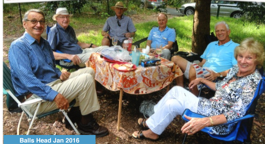
Balls Head Jan 2016