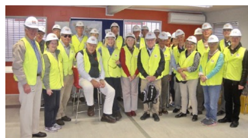
at the Northern Beaches Hospital site