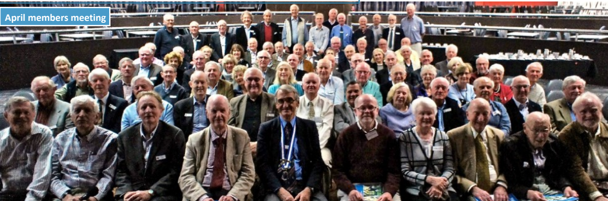
April members meeting