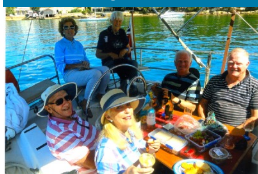
Sailing on Renada