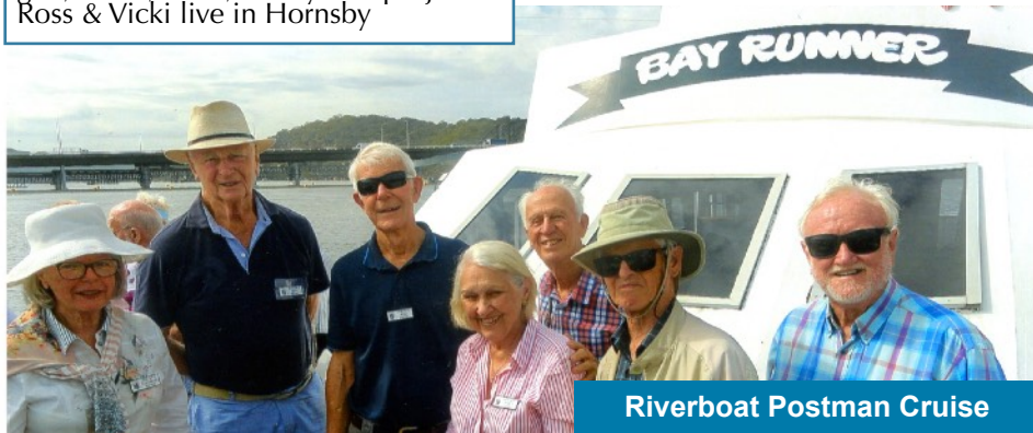
Riverboat Postman Cruise