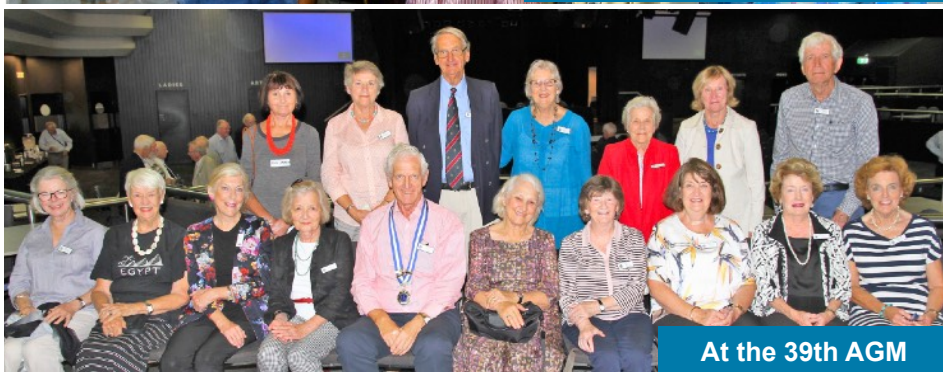
At the 39th AGM

Payments: Kindly pay for outings in advance of any deadline and online if possible. When paying online, please ensure that you quote your name & the relevant activity, albeit abbreviated, in the description to minimise any confusion. Note the following bank account details: