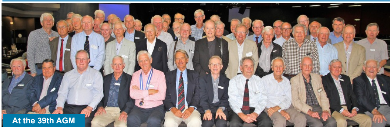
At the 39th AGM