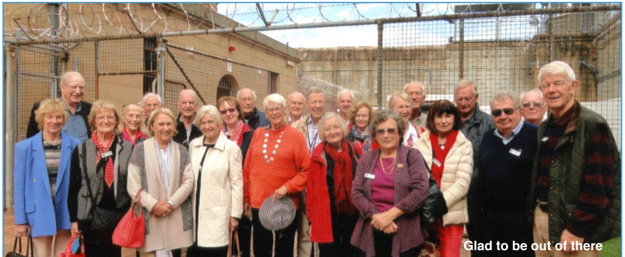
Glad to be out of there