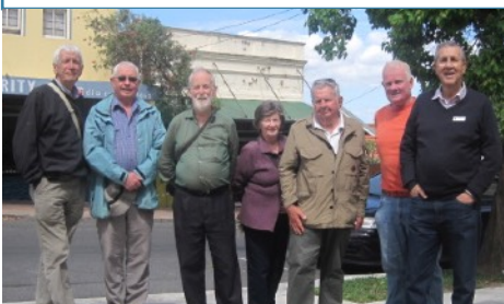
a meander through North Sydney