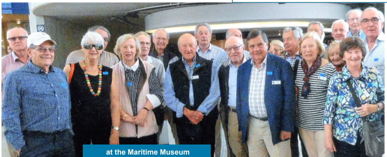
at the Maritime Museum