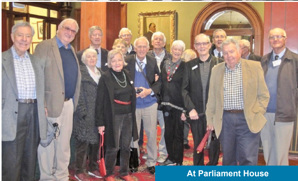
At Parliament House