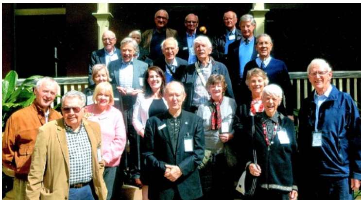
At Parliament House