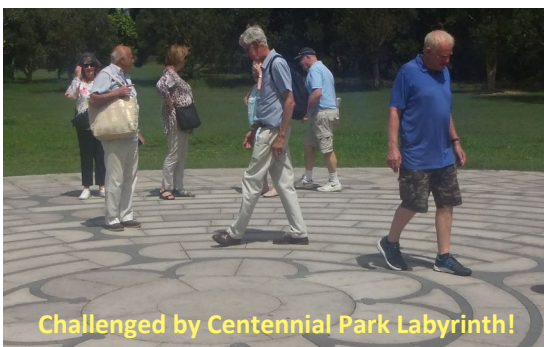
Challenged by Centennial Park Labyrinth!