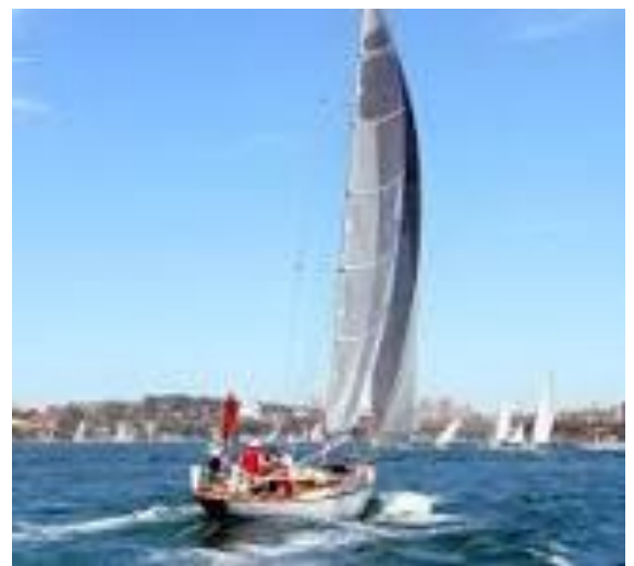
Caprice of Huon