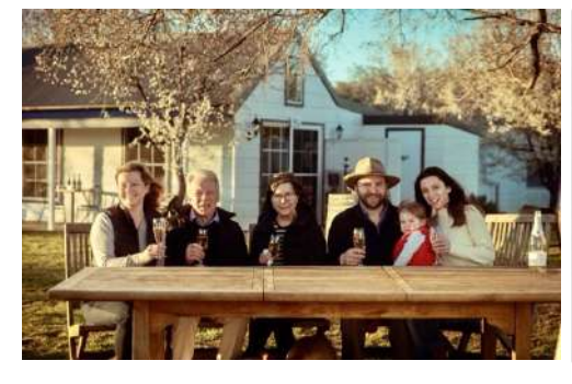
De Beaurepaire Wines - the family