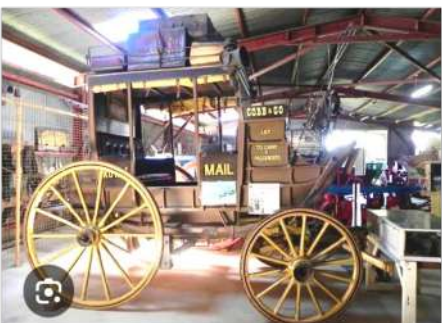
The Gulgong Pioneer Museum